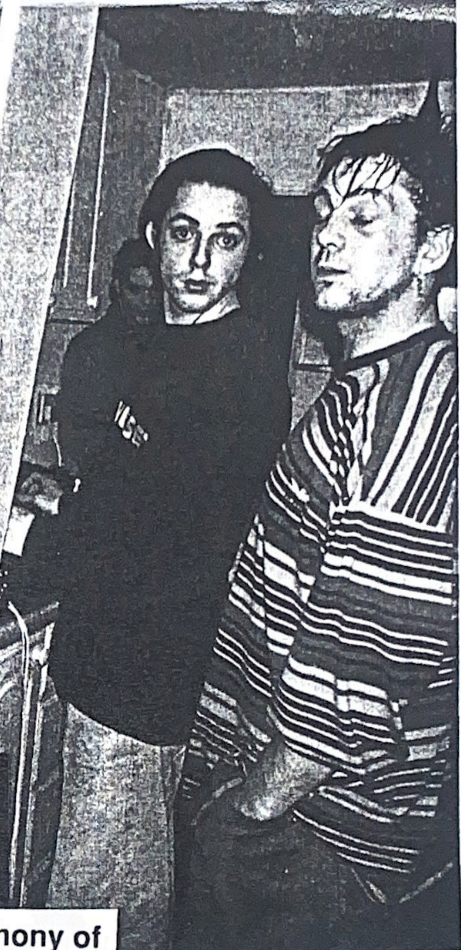
"A sweating cacophony of hypnotic, no-nonsense dance . . . highly recommended"