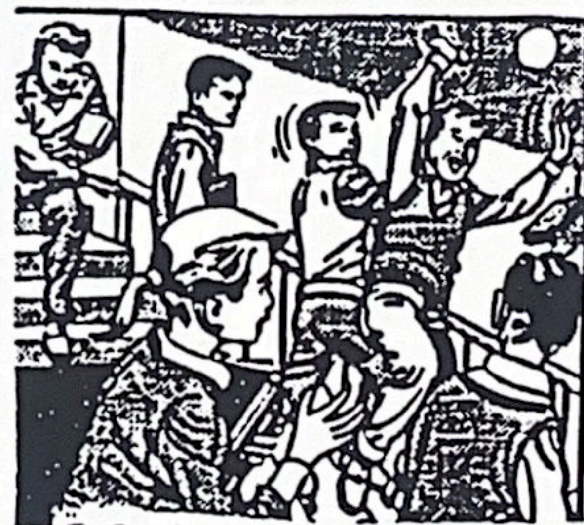
IN PUBS IT'S NOT ONLY RIDE TO CROWD AND PUSH—BUT DOWNRIGHT DANGEROUS.